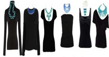
Turtleneck Long chain or pendant Crew Bib or collar Scoop Short pendant with volume Strapless Layered choker Square Angular pendant Off-shoulder Asymmetric