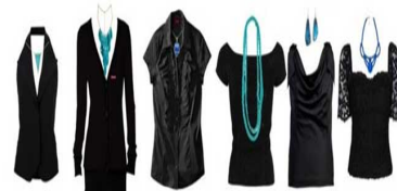
Halter Slim pendant V-neck V-shaped pendant Collar Short pendant or choker Boat Long strand of beads Cowl Statement Earrings Sweetheart Carved beads or pendants

The Senior Clothing Construction project is divided into two project levels: Intermediate and Advanced. The Advanced level includes constructing garments which require more construction knowledge and skill refinement than the intermediate level.